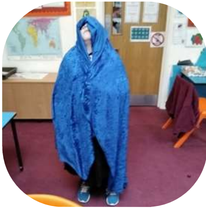
King Neptune was created with some fabric from the class.

On World Book Day, 7th March 2024, Beach Class enjoyed dressing up and completing lots of book based activities, including making book marks, quizzes about characters and stories, creating a class library and listening to an audio book - Horrid Henry. They were also given the opportunity to choose their favorite books.